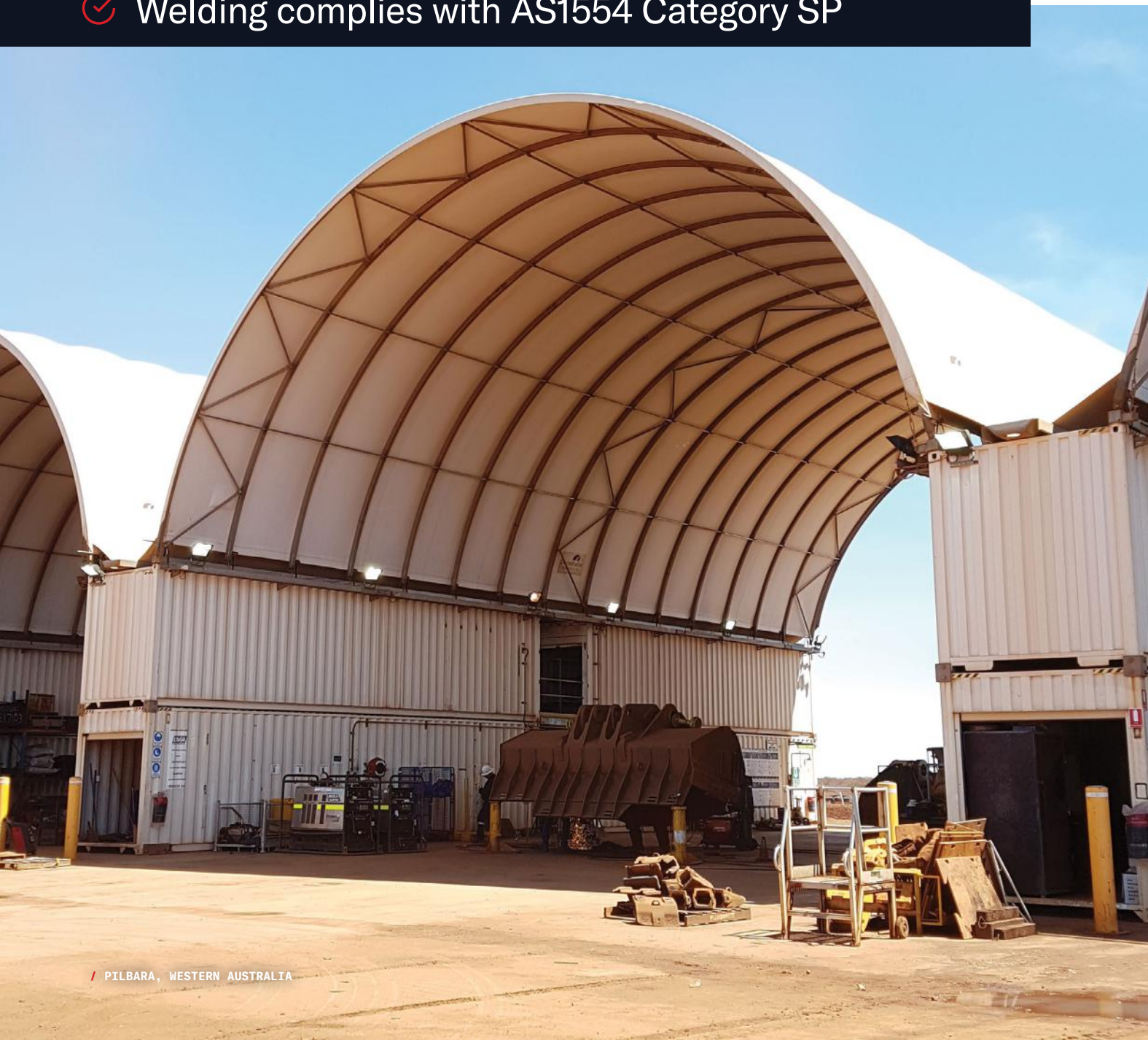
/ PILBARA, WESTERN AUSTRALIA

✓ Welding complies with AS1554 Category SP