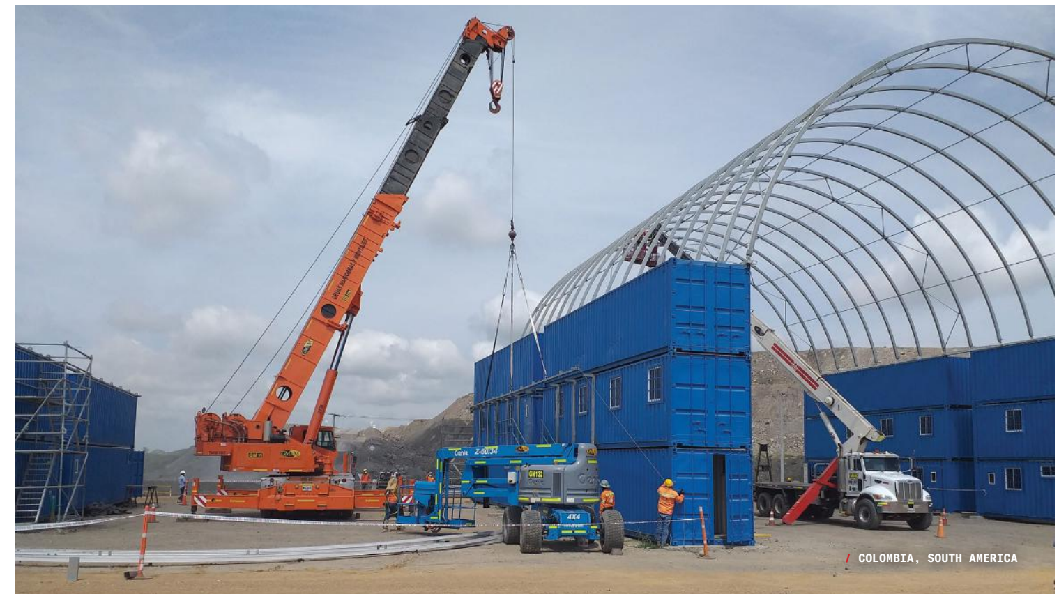
/ COLOMBIA, SOUTH AMERICA