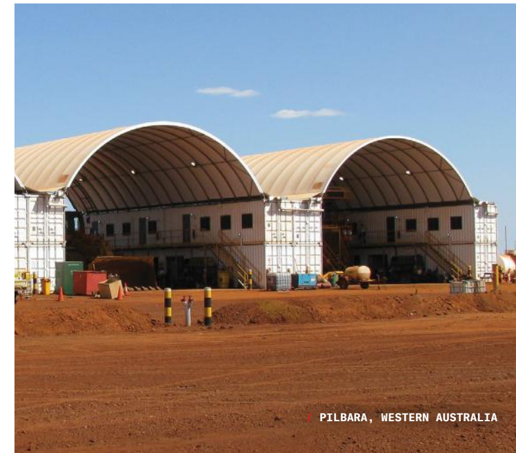
/ PILBARA, WESTERN AUSTRALIA